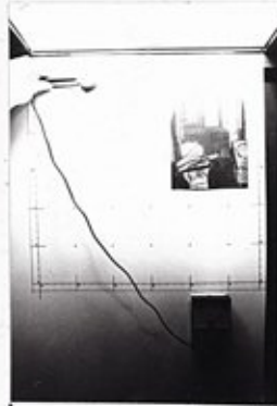
1300 LX | 39%