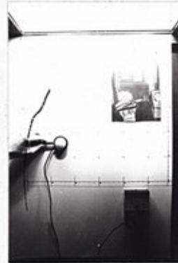
100 LX | 3%