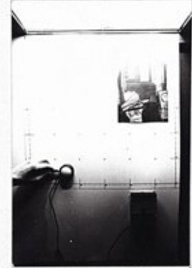
50 LX | 1.5%