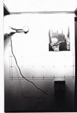
700 LX | 21%