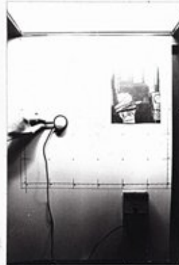
200 LX | 6%